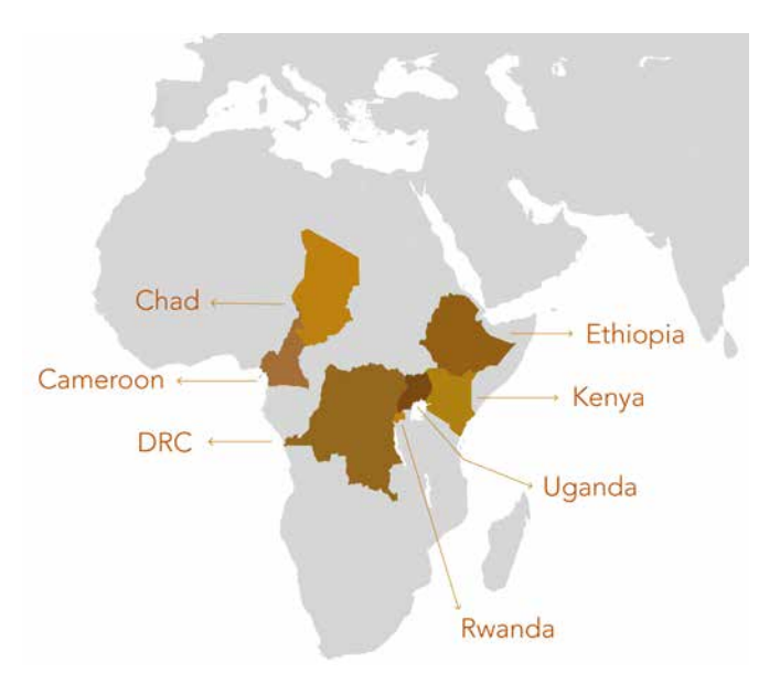
Figure 3. Map of Africa showing current focus countries

While the humanitarian sector is highly skilled at delivering life-sustaining relief items as well as education, water and sanitation, shelter and other critical services to displaced people, additional contributions from other sectors are needed as the number of refugees grows in sub-Saharan Africa due to climate and conflict-related crises as indicated in the displacement global trends report by UNHCR (2019).