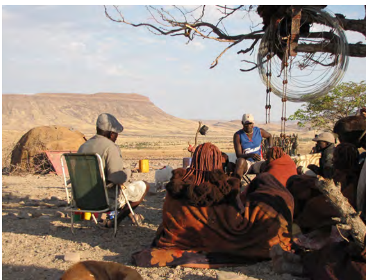
A community forest awareness meeting in Sanitatas Conservancy in the Kunene Region, Namibia.

Permitting procedures remain unclear and unharmonised between Ministries, with uncertainty regarding which permits are required from which institution. Permits for collecting research samples are authorised by the National Commission on Research, Science and Technology under the Research, Science and Technology Act No. 23 of 2004 . Additional permits from the Ministry of Environment, Forestry and Tourism may be required for protected or specially protected species. Export permits are authorised by the Ministry of Environment, Forestry and Tourism or the Ministry of Agriculture, Water and Land Reform, and a phytosanitary certificate from the latter is also required for any plant material transported out of the country. Multiple permitting procedures through multiple institutions can lead to confusion, delays, and create barriers to research.