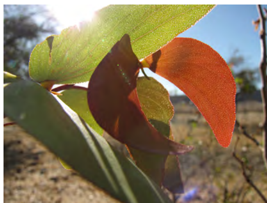
The leaves, twigs and branches of the mopane tree are used traditionally while the seeds are harvested in the Kunene Region, Namibia for extraction of an essential oil used in the cosmetics industry.

In Namibia, many households depend on the income generated from biotrade and multiple systems exist for the sustainable management of resources and benefit sharing. For example, in the Kunene Region, products are traded through the Kunene Conservancies Indigenous Natural Products Trust, a legal entity owned by conservancies that enters into trade agreements with industry partners. The use of the conservancy institutional framework ensures sustainable management of the use of resources and equitable benefit sharing through direct payment to harvesters for raw materials. The Opuwo Processing Facility, owned by the Trust, processes the raw materials and produces essential oils. A percentage profit share is divided based on the value of all raw material collectively harvested by each participating conservancy. The Eudafano Women's Cooperative in Oshana Region produces marula oil for international markets and has 26 associations and 2 500 members. Raw materials are processed into oils at Eudafano Women's Marula Manufacturing in Ondangwa, owned by the cooperative, which has enabled increased income to members.